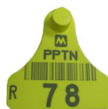
Example of R-tag